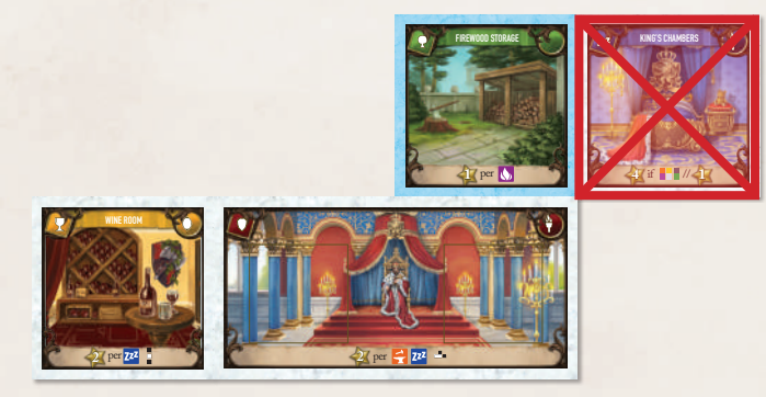
The King's Chambers cannot be placed here (on the second floor of the castle) until there is a room underneath to support it

NOTE 4: Food, living, utility, outdoor, and sleeping rooms can only be placed at the ground level (throne room level) or above. Corridor rooms can be placed on any level of your castle, including below ground, and downstairs rooms can only be placed below ground. There is a reminder of this on your player aid.