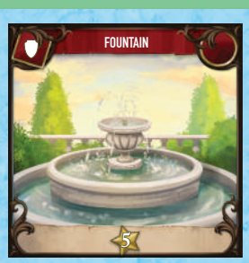
"Who doesn't like a fountain?"

IMPORTANT : Fountains have the same limitation as outdoor rooms—room tiles cannot be placed above them.